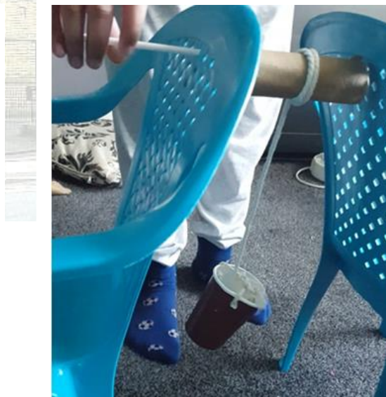
A science lesson at home